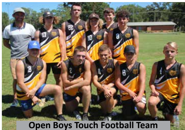
Open Boys Touch Football Team