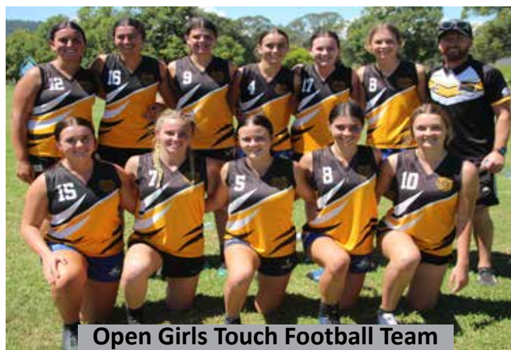
Open Girls Touch Football Team