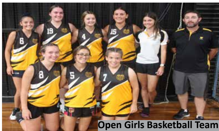
Open Girls Basketball Team