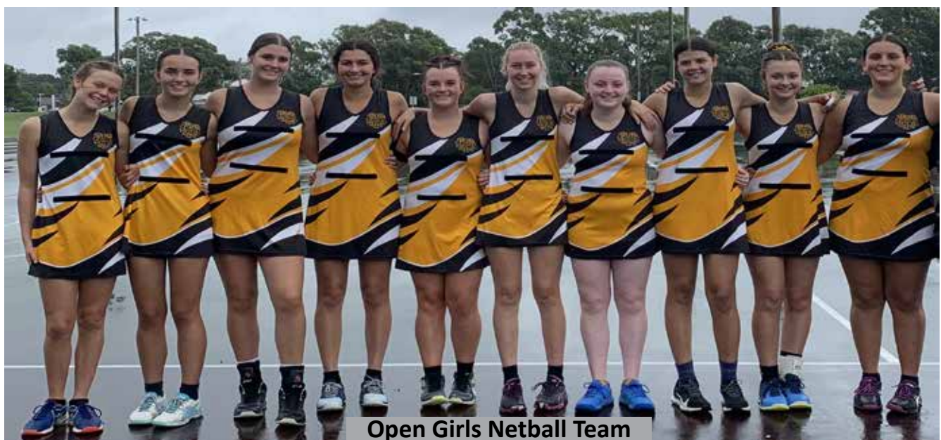
Open Girls Netball Team