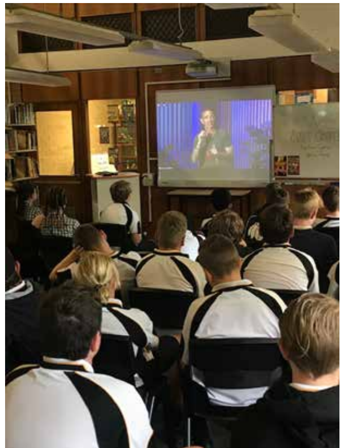
Author Andy Griffiths talking on the screen to Year 7 students live in real time.

During week 8, some Year 7 students had a “virtual excursion” to attend a talk by popular author Andy Griffiths. It was an event hosted from Sydney Opera House and Andy was speaking to students live in real time. School students asked pre-recorded questions and Andy answered them for all to hear. It gave us some insight into his writing process and we were only sorry we couldn’t have met him in person... imagine that!