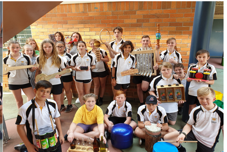
Check out our wonderful Year 7 Music Instrument they made. Awesome work Year 7