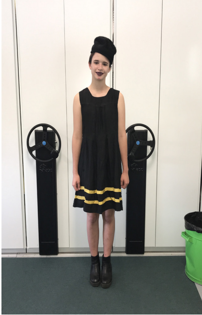
1940s Tunic Sports Dress