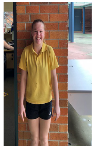
2018 Sports Uniform