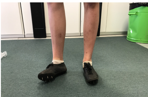
1940s Running Spikes. These are now illegal