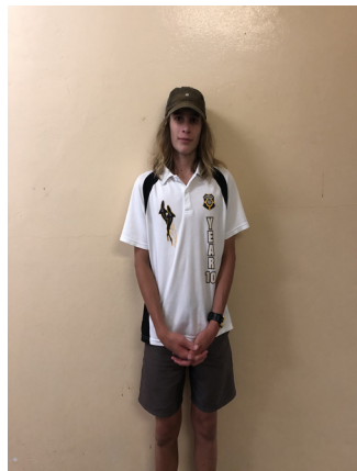
2018 Boy School Uniform