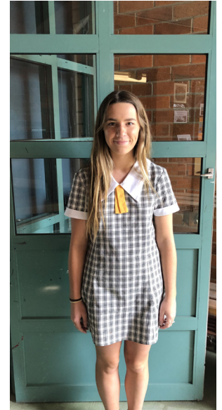
2018 Senior Summer Uniform