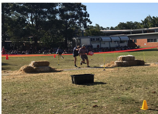
Horse racing Teachers vs Students