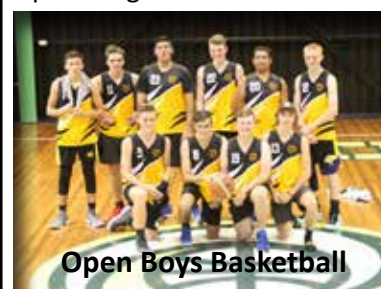
Open Boys Basketball

School Cross Country was held at the Taree Park Run on the Riverbank this year and the students adapted to the new changes. Congratulations to everyone who participated and best of luck to those students going to Zone at the end of Term 1.