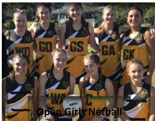
Open Girls Netball

Open mixed touch team travelled to Sydney to compete in the Open Mixed State Touch Challenge. They played 4 games in their round games winning 3. This put them in 2nd place in their pool and making quarterfinals. They played Holy Cross College losing only by 1 try, final score Holy Cross 4 - Taree 3.