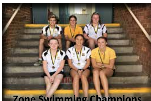
Zone Swimming Champions