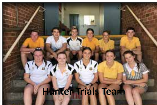
Hunter Trials Team