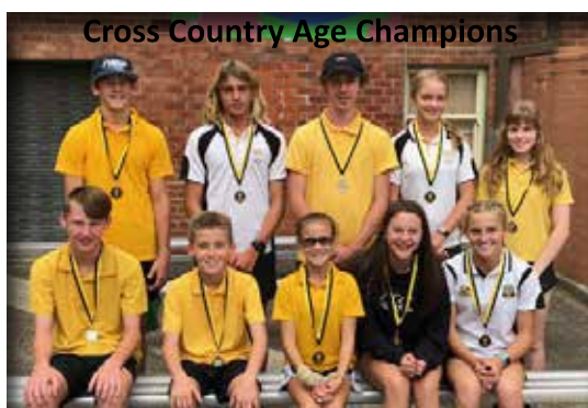
Cross Country Age Champions

Our Open Boys & Girls Basketball team made top 8 in knockout rounds which put them through to the Hunter Finals, played at Maitland. Both teams won their first games convincingly, putting them through to the quarterfinals which they both lost to Hunter Sports High School.