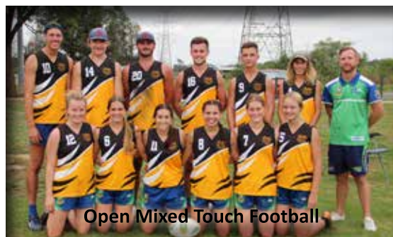
Open Mixed Touch Football

Open mixed touch team travelled to Sydney to compete in the Open Mixed State Touch Challenge. They played 4 games in their round games winning 3. This put them in 2nd place in their pool and making quarterfinals. They played Holy Cross College losing only by 1 try, final score Holy Cross 4 - Taree 3.