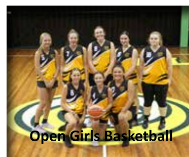
Open Girls Basketball

Open Girls Netball played their first knockout round on 27th February, winning 3 out of 4 games which put them second and moving on to the Super 16 Round Robin played in Newcastle on 20th March. The girls played 2 games winning against Maitland but a loss to Kotara High. A very windy day caused havoc for our shooter but the girls played some great netball.