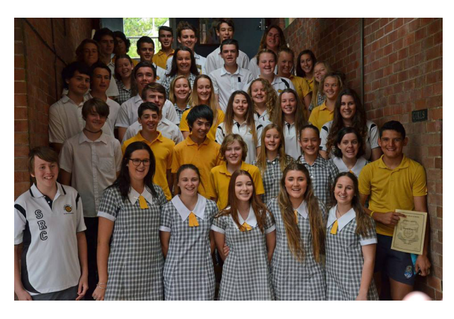
CO-OPERATION, PARTICIPATION AND RESPECT

The PBL prize box has been replenished! We have new iTunes and Google Play vouchers and pizza vouchers are on their way! Good luck to all who have tickets in the draw. Thank you to our students who continue to follow our core values of CO-OPERATION, PARTICIPATION and RESPECT!