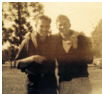
1960s buddies forever.