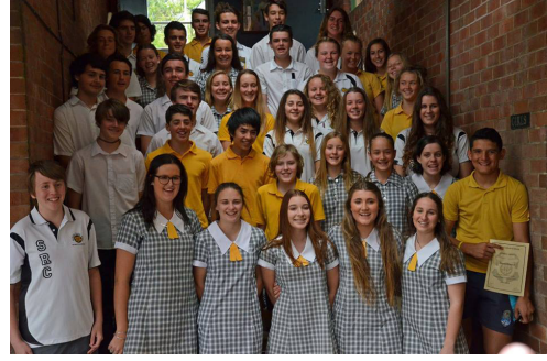
STUDENT REPRESENTATIVE COUNCIL Congratulations to all of the students voted onto the 2015/2016 Student Representative Council.