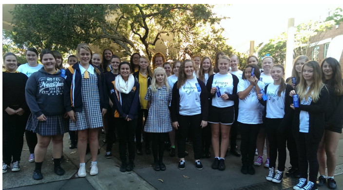
Yr 9 & 10 Vocal Extension Class & 'Singas'