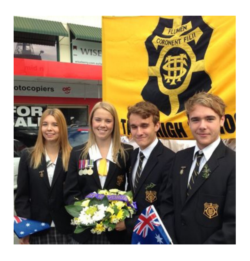
ANZAC PARADE 2013