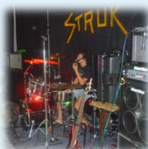
Lunch time concert