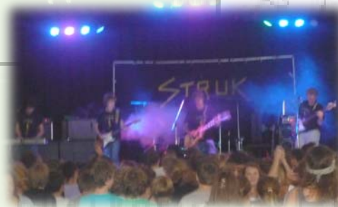
Lunch time concert