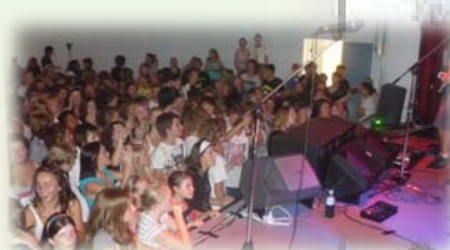
Lunch time concert