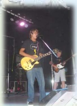
Lunch time concert