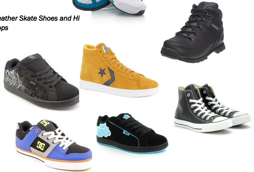
Leather Skate Shoes and Hi Tops