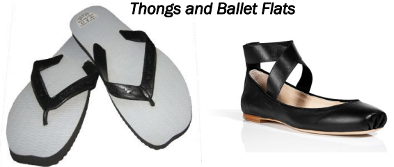
Thongs and Ballet Flats